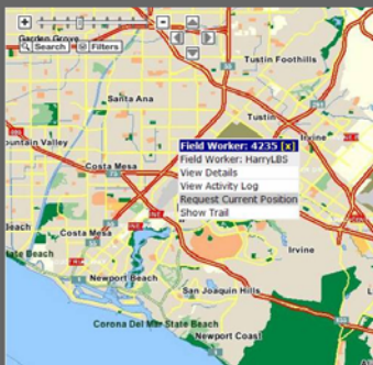
View Individual worker details including activity and current position.