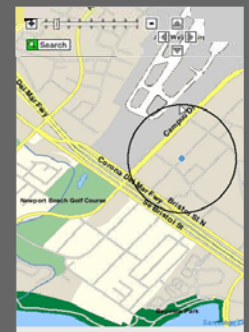
Smart fences can be setup around any mapped location.